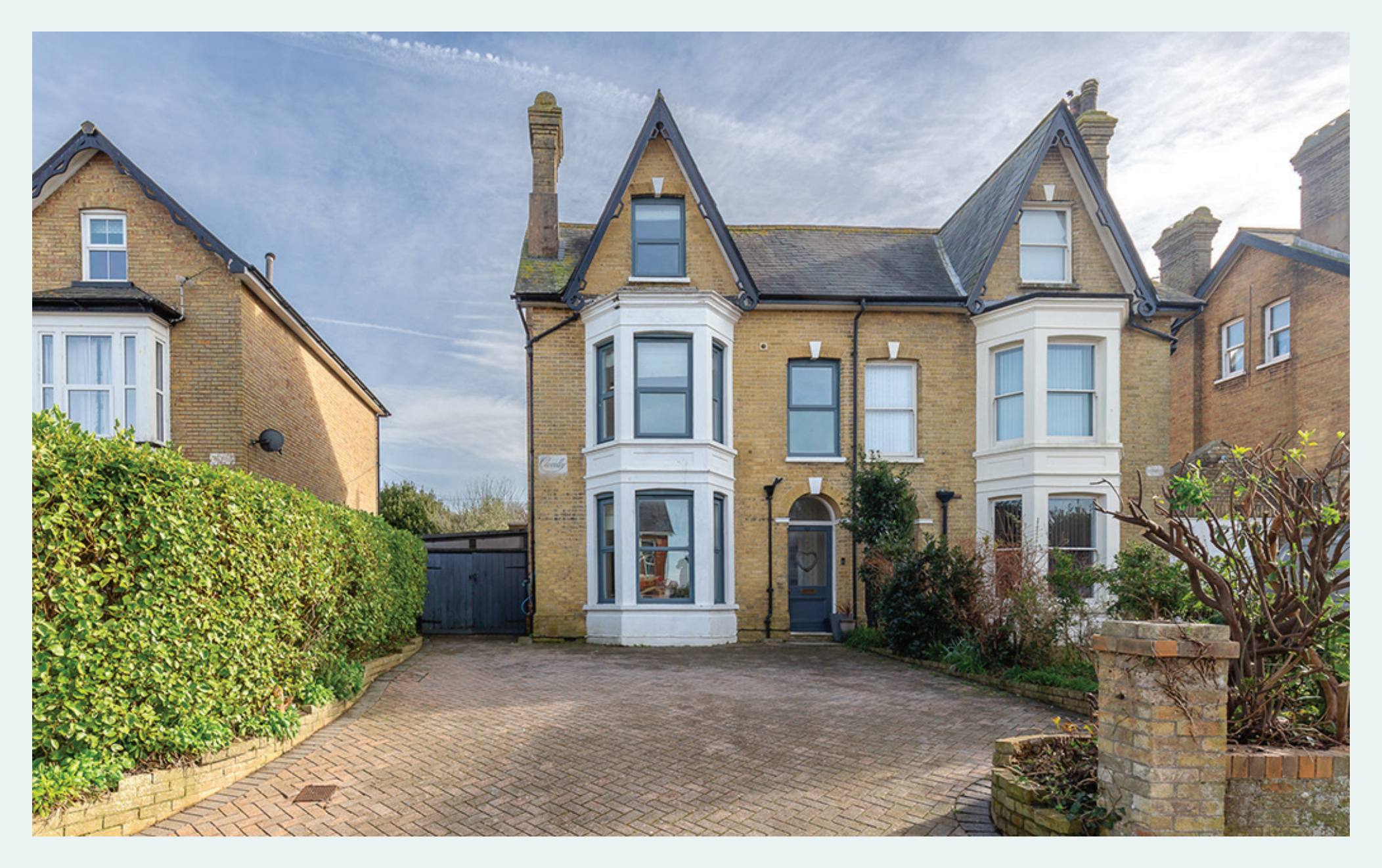
117 Castle Road, Carisbrooke, Isle of Wight